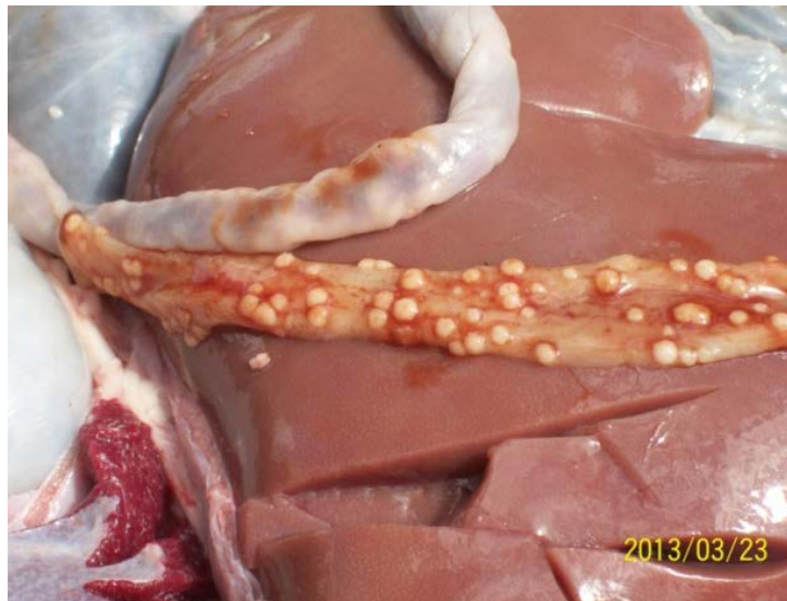
Figure 1. Diffuse thickened intestinal mucosa with white multiple nodules at the surface and with haemorrhagic fluid content.

et al., 2012). In addition, hepatobiliary coccidiosis with liver failure in dairy goats has been reported (Kahn and Line, 2010). Here the first report of caprine coccidiosis in the Green Mountain Area in Libya is documented.