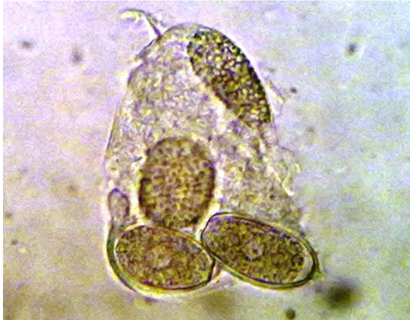
Figure 4. Microscopic examination of wet smear of the affected mucosa shows coccidia oocysts in the epithelial tissue, \times 1000 .

(Fawzia, 2007). Therefore, screening of the disease in Libya is also highly recommended and can easily be done using the simple microscopic examination. Control is aimed firstly at preventing access of goats to large numbers of oocysts, and secondly at reducing stress in the goats' environment. The use of preventive drugs is a third avenue of control that may be necessary in high-risk situations. Occurrence of this disease in this severity can be explained and discussed by the following reasons: