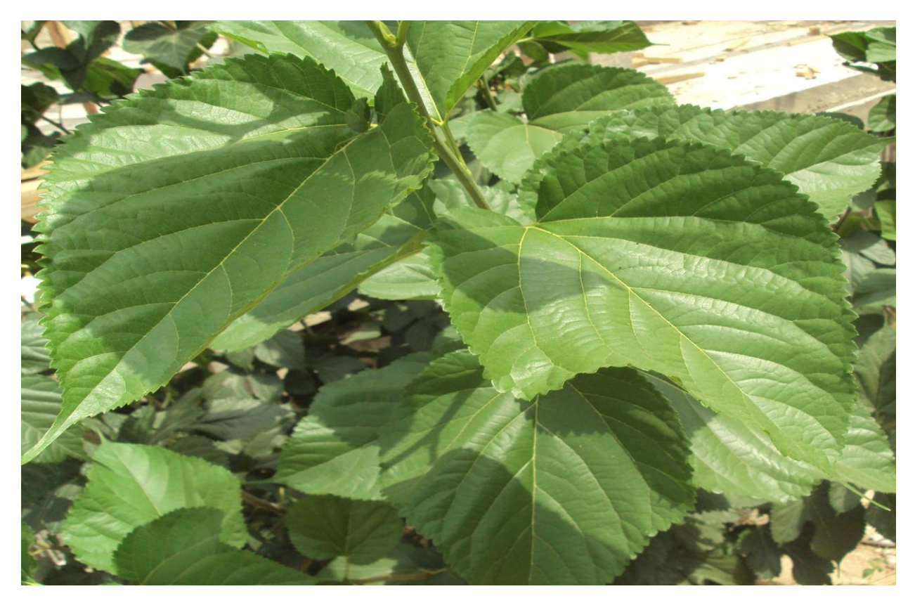
Figure 4. Leaves of Morus alba showing serrated margins.

obtain the extract. The extract was filtered and evaporated to dryness under reduced pressure on a rotary evaporator. The concentrated extracts were dried by placing them in a dessicator. The weights of the crude extracts after drying were measured.