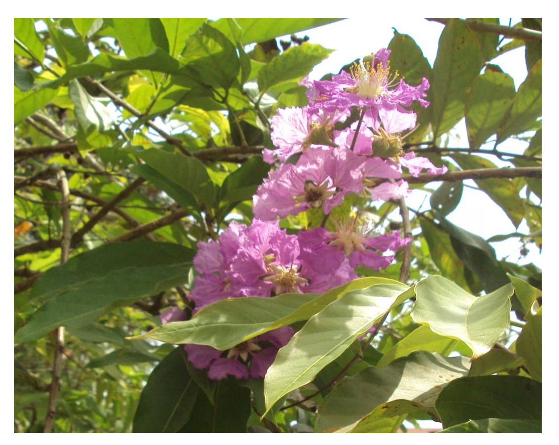
Figure 1. Violet flowers of L. speciosa.

Type II diabetes often show no symptoms. It occurs as a result of the decline in cell membrane insulin sensitivity that can be aggravated by the consumption of high-glycemic carbohydrates, obesity, lack of exercise and aging process.