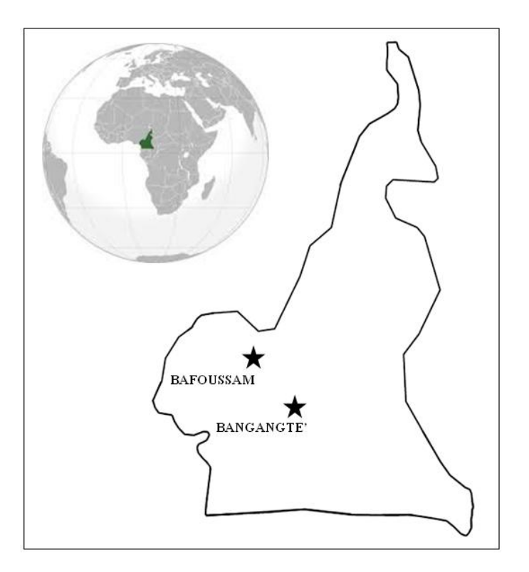
Figure 1. Map of Cameroon: localization of the hospitals included in the study.

27 G genotypes (G1-G27) and 35 P genotypes (P[1]-P[35]) have been described for RVs (Matthijnssens et al., 2011). Five combinations of these are common worldwide (G1P[8], G3P[8], G4P[8], G2P[4], and G9P[8]), accounting for 70% of globally identified strains (WHO, 2011; Cashman et al., 2011). However, these fully identified combinations account for only 36.5% of strains circulating in Africa (Todd et al., 2010). In recent years, other G/P combinations have been found to be highly prevalent in various areas of the world (De Donno et al., 2009; Petrinca et al., 2010; Iturriza-Gómara et al., 2011; Patton, 2012). In Cameroon, in particular, has documented the presence of novel human rotavirus genotypes, such as G5P[7], G5P[8], G8P[8] (Esona et al., 2004, 2009). This data reinforce the need to continue with surveillance programs in Cameroon where a high diversity of rotavirus strains has been reported.