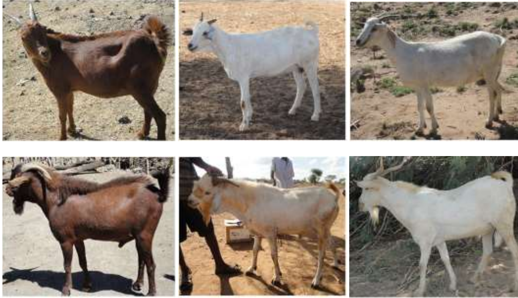
Figure 2. Physical appearances of Ethiopian adult goats: Bati (left), Borana (middle) and Short-eared Somali (right).

had beard while about 25% of Bati and Borana as well as 17.9% of Short-eared Somali does were bearded.