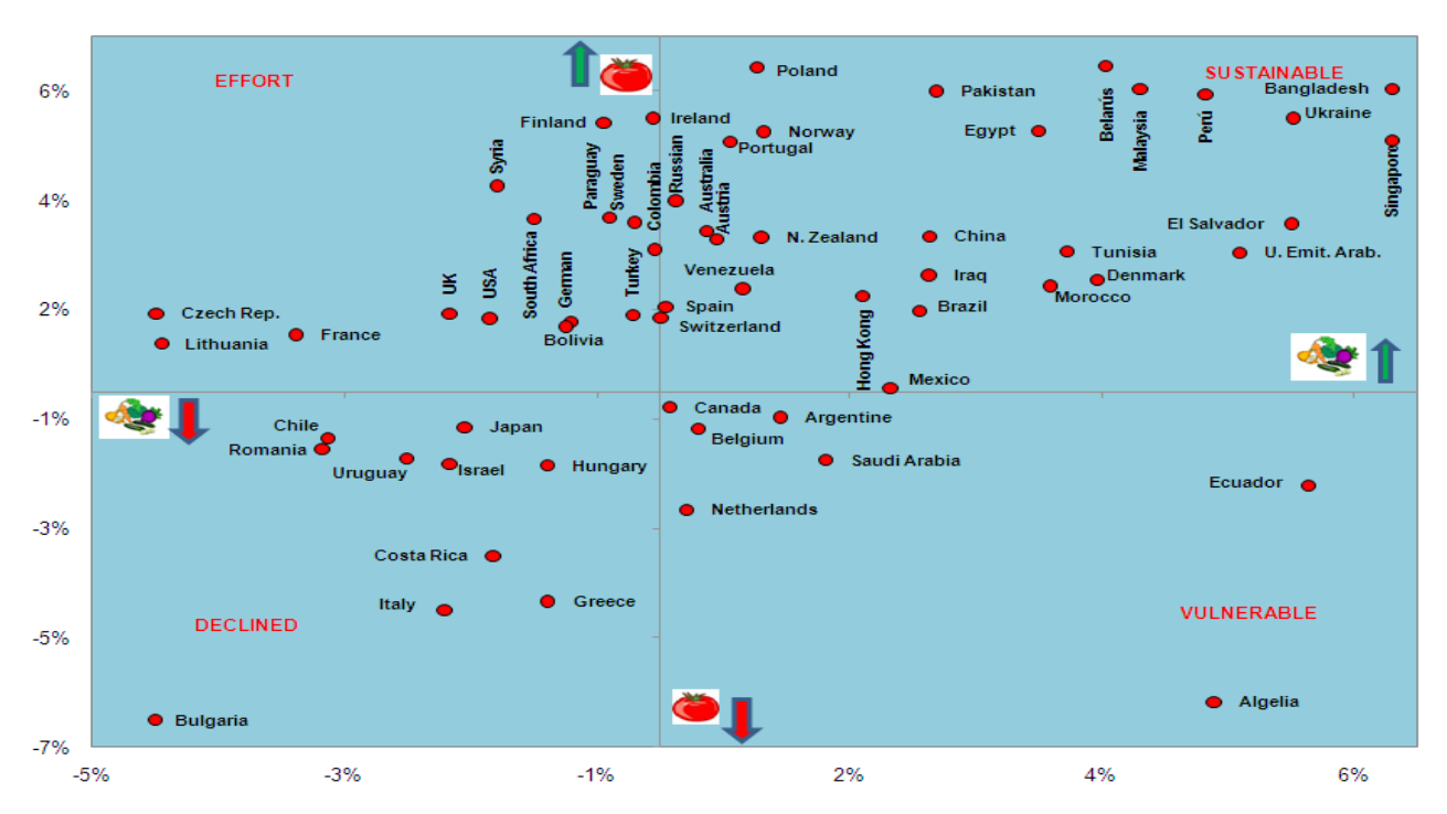
Figure 1. Change in global tomato consumption (2002 to 2009).

competition is more intense through the sale price and therefore through the relevance of a competitive cost. It is important to note that comparing perceived price/quality by the buyer or importer is the factor related to cost competitiveness; in general, there are differences in product supply in terms of presentation, packaging, commercial quality, varieties, etc.