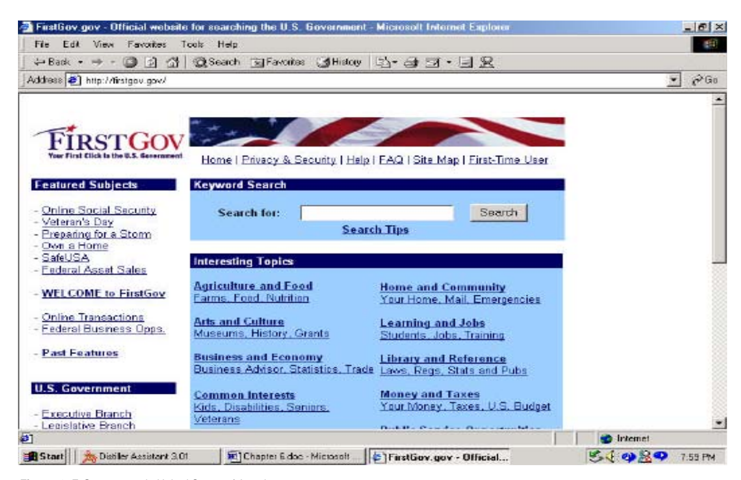
Figure 2. E-Governance in United States of America.