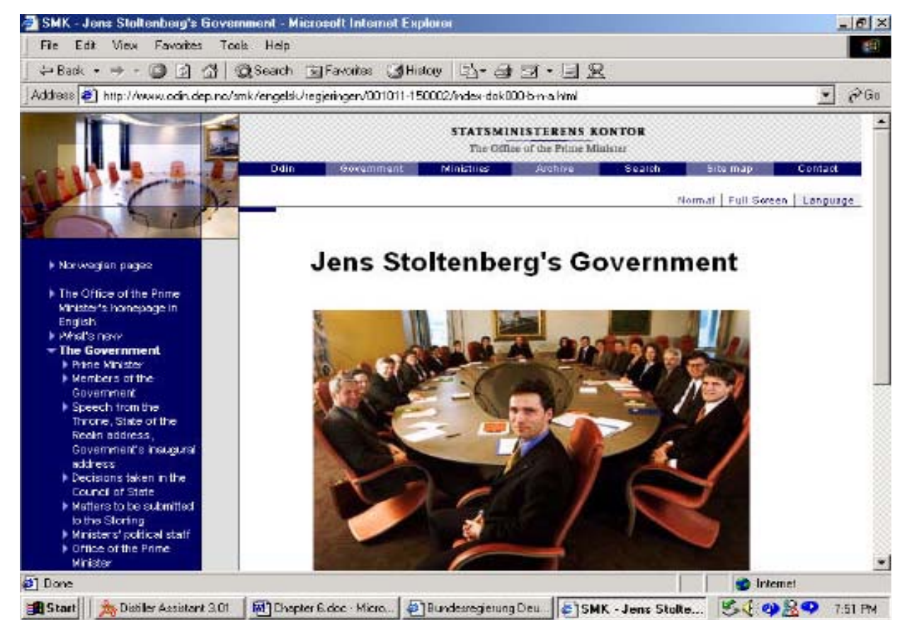
Figure 5. E-governance in Norway. Source: Norris (2000).