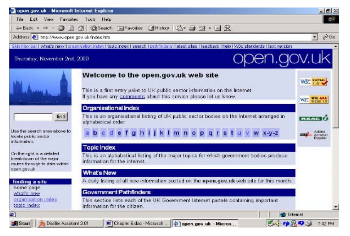
Figure 3. E-governance in UK.