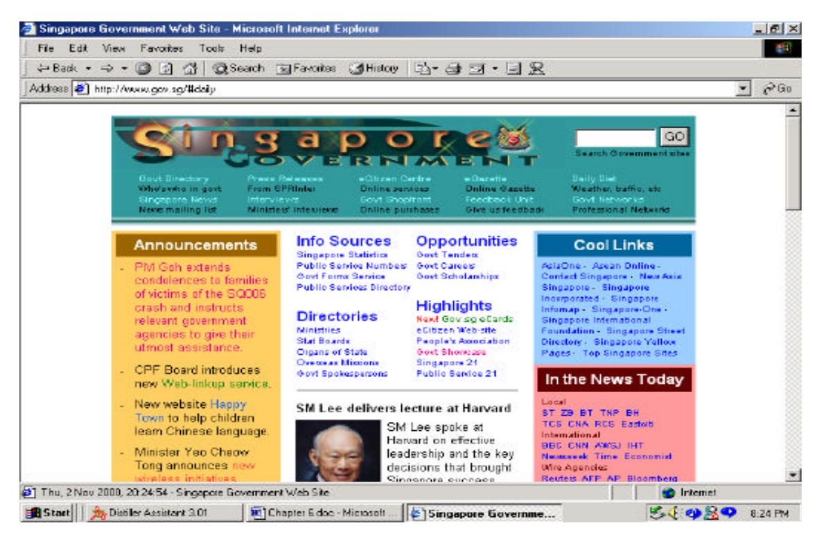
Figure 4. E-governance in Singapore. Source: Norris (2000).