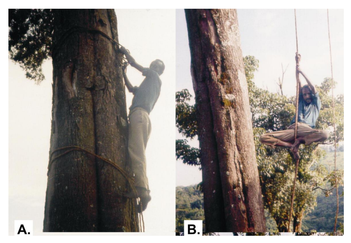
Figure 3. Beekeepers climbing on long trees to hang traditional hives using rope (A) and climbers "Hareg" (B).

and wax together in Kaffa and Sheka Zone, but in Bench-Maji Zone they are using bark and scrap of C. africana after the log hive construction.