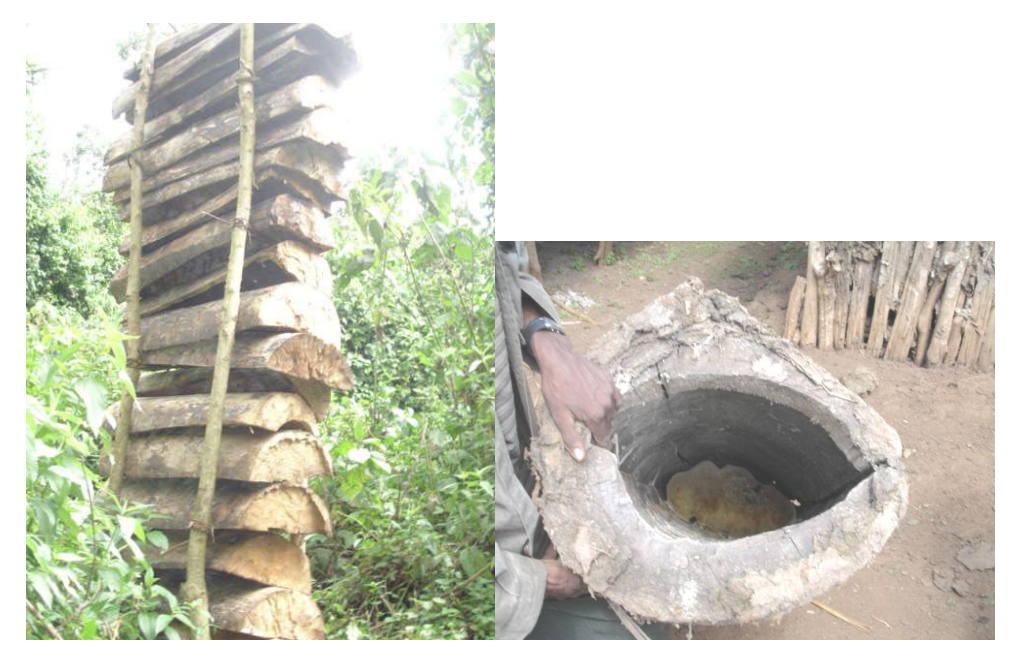
Figure 2. Traditional log hives used in the study areas.

log hives made from local materials and mainly nonprocessed log Cordia africana and Croton macrostachyus . In the areas, the ways of constructing traditional behive differ from Zone to Zone, however it is more or less the same in Kaffa and Sheka Zones while it differs in Bench-Maji Zone in terms of hive length, hive opening style and design of the hive. The length of beehive in Kaffa and Sheka Zones ranges from 0.75 to 1.5 meters (n = 120) and in Bench-Maji Zone it ranges from 1 to 2 m (n = 30, Figure 2).