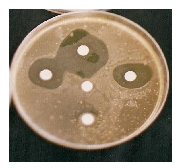
Plate 2. Inhibition of Staphylococcus aureus by ethanol extract of H. sabdariffa using disc diffusion method.