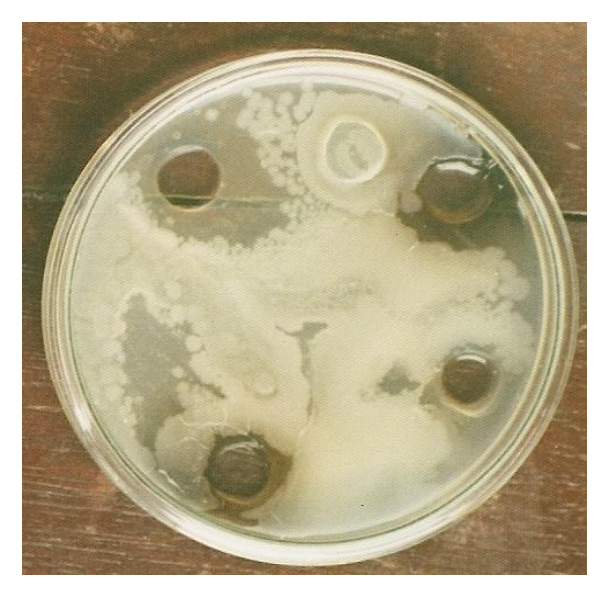
Plate 1. Inhibition of Streptococcus mutans by ethanol extract of Hibiscus sabdariffa using open well diffusion method.

The widest zone of inhibition (47.9 mm) was observed by the ethanol extract of H. sabdariffa against S. aureus in the open well diffusion method (Plate 2). This value was followed by 45.8 mm observed in the open well diffusion method for the ethanol extract of Roselle against Escherichia coli . A beverage containing H. sabdariffa L.