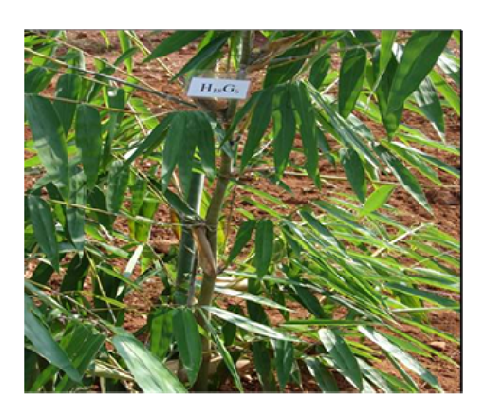
Figure 2. Dendrocalamus giganteus (giant).

Key: Zone A= hillside/steep sloping farmland, Zone B= hillside/gentle sloping farmland, Zone C= flat farmland / river bank/not wetland, Zone D= flat farmland/wetland and Zone E= homestead.