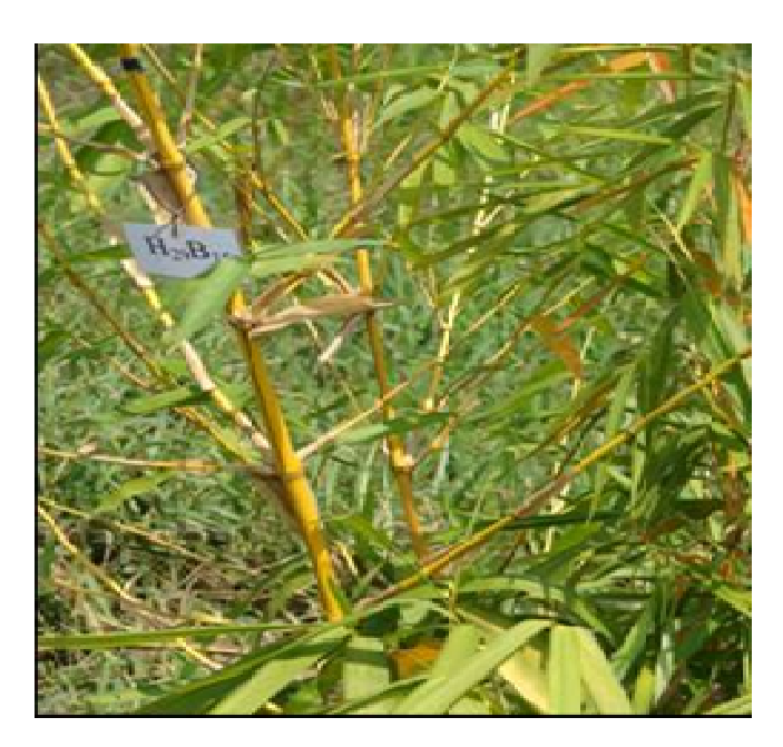
Figure 3. Bambusa vulgaris (common bamboo) tagged.

ted 40 km north east of Nairobi city of Kenya. Planting of the cuttings in the four study sites were undertaken during the short rain season of September - December, 2006. Compost manure was applied to promote prolific growth of the cuttings. Intercropping with kales and legumes such as beans and cowpeas was also done to minimize losses that the farmers would incur during the growth cy-