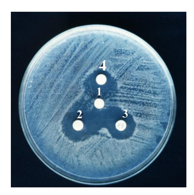
Figure 1. Detection of ESBL production in Klebsiella pneumoniae 6 C by disk approximation method: 1. Amoxicillin-clavulanate disk (20/10 \mu g); 2. Cefotaxime disk (30 \mu g); 3. Ceftazidime disk (30 \mu g); and 4. Ceftriaxone disk (30 \mu g).

were also resistant to ceftazidime, ceftizoxime, and ceftriaxone but not for cefotaxime.