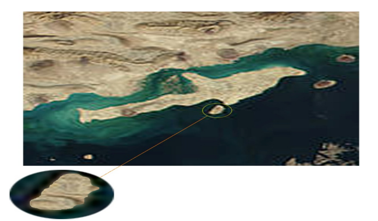
Figure 1. Situation of Hengam Island.