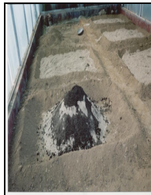
Preparation of pits

The mathematical benefit-cost ratio (Kothari et al., 2006) can be expressed as: