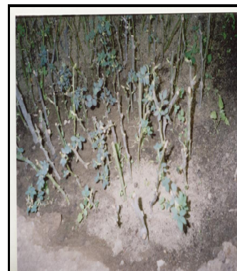
Nursery for rose cuttings