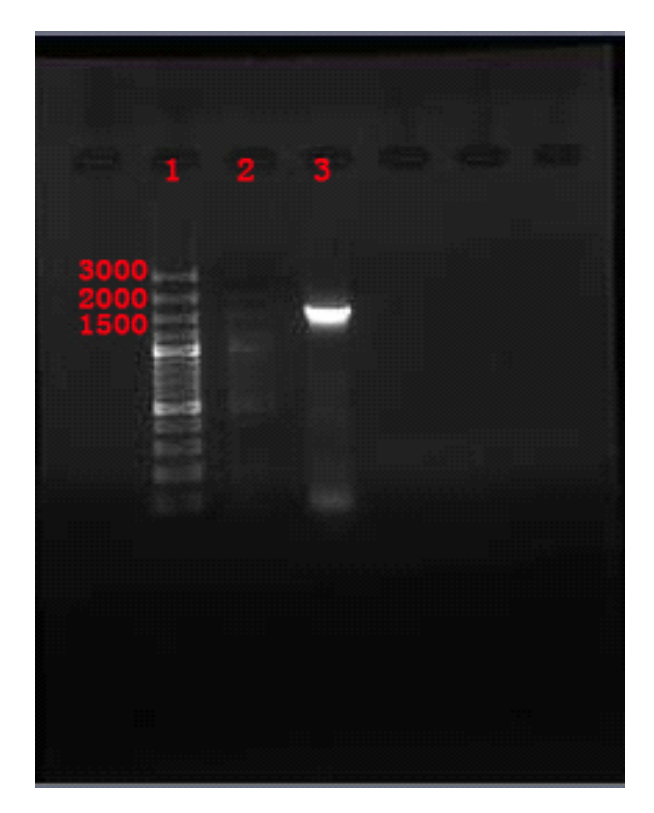
Figure 1. PCR product of amplified S1 gene. Lane 1: Ladder (100 bp); lane 2: negative control; lane 3: amplified S1 gene (about 1700 bp).