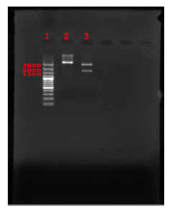
Figure 4. Agarose gel electrophoresis of construct S1-pPICZ \alpha A digested by EcoRI and Notl. Lane 1: ladder (100 bp); lane 2: undigested construct; lane 3: digested construct.