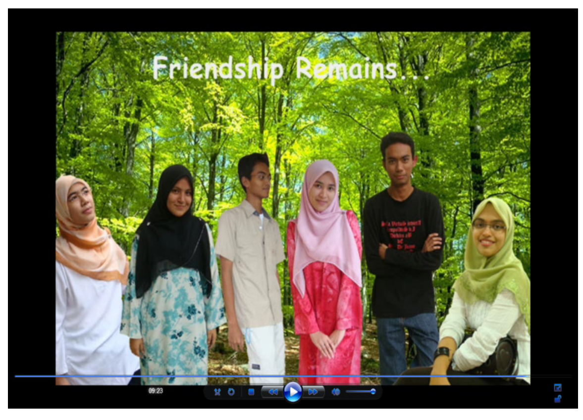
Figure 4. Publishing a video clip can be an exciting students' group activity where they work together and share different knowledge, ideas and experience in producing a good product to their audience.

and unleashed their hidden talents (Figure 4).