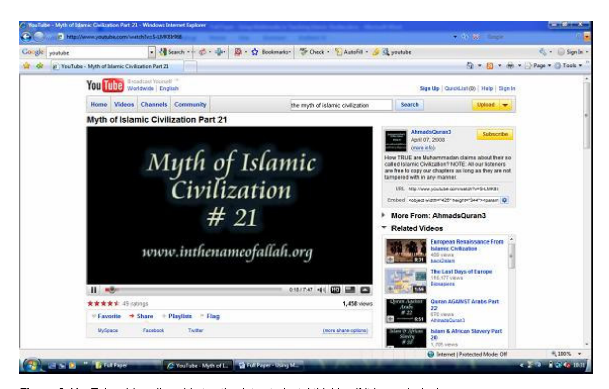
Figure 6. YouTube video clips able to stimulate students' thinking if it is used wisely.

itself but a means toward achieving learning goals and objectives. Effective instructional video is not television- to-student instruction but rather teacher-to-student instruction, with video as a vehicle for discovery (Duffy, 2008) (Figure 6).