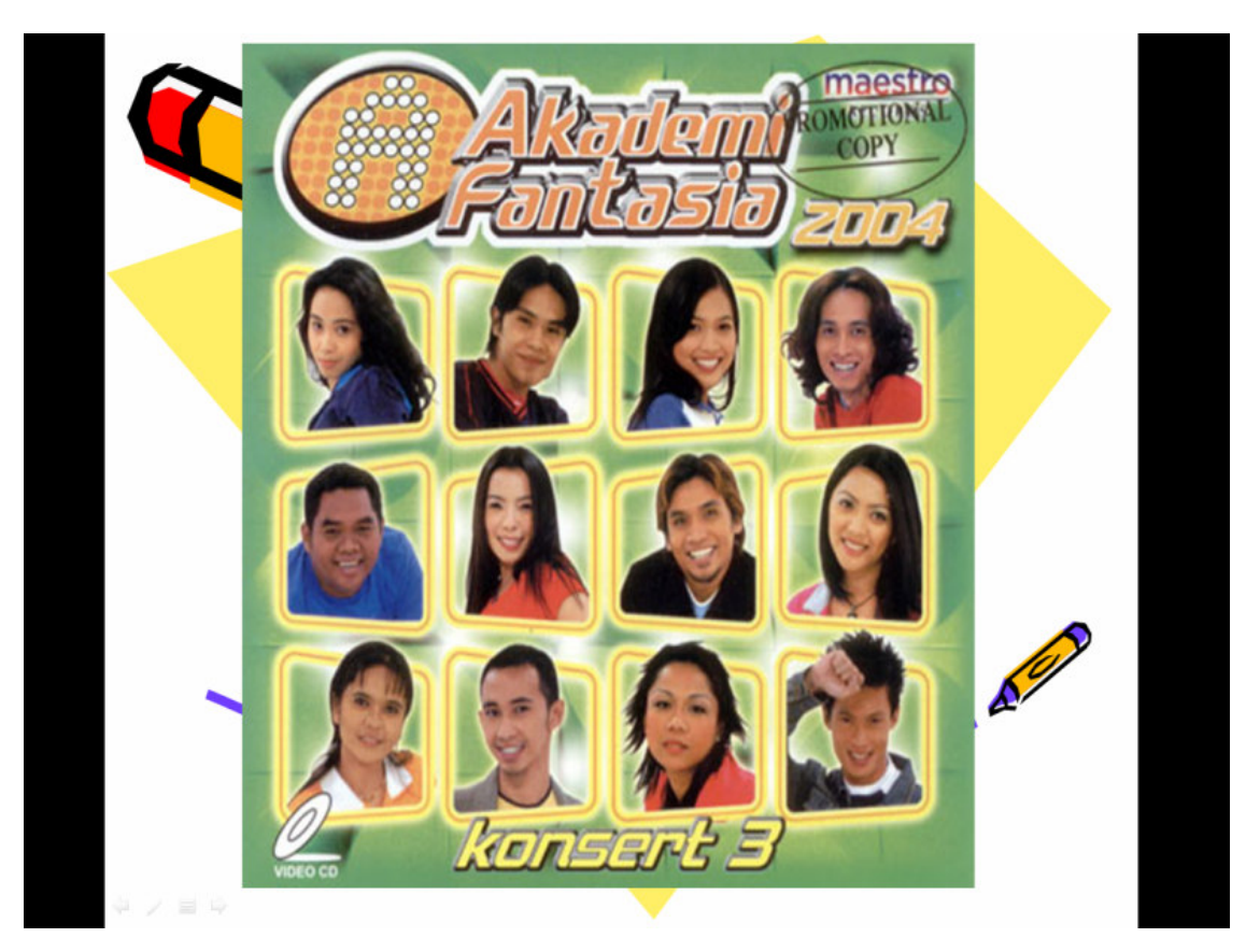
Figure 2. Inserting some graphics into PowerPoint slide able to stimulate audience thinking in a better way.