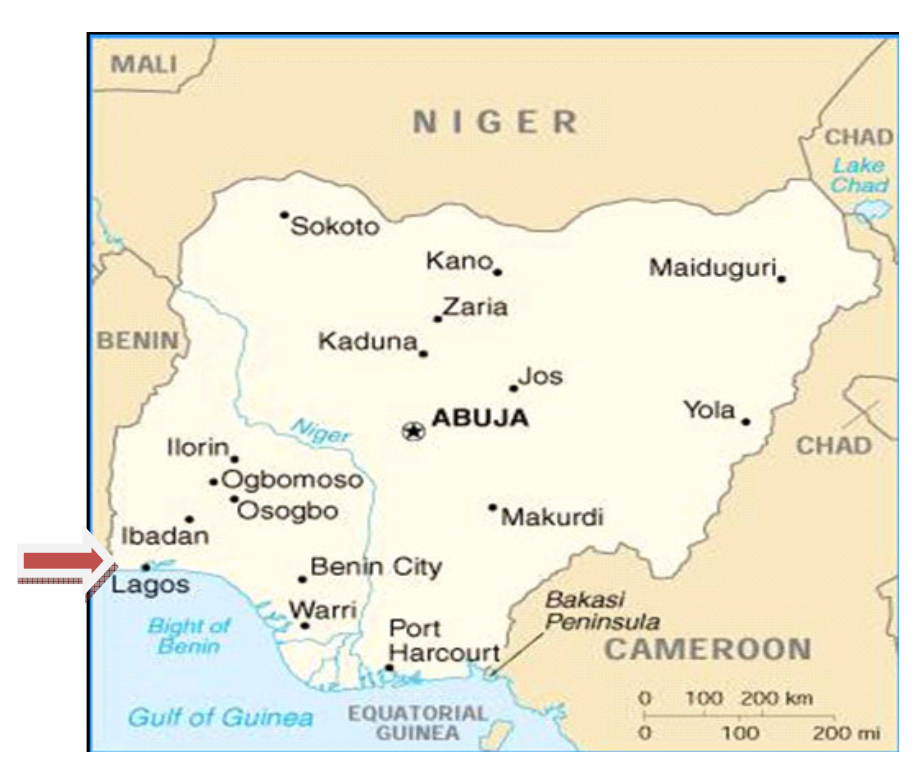
Figure 2. The location of Lagos, Nigeria.