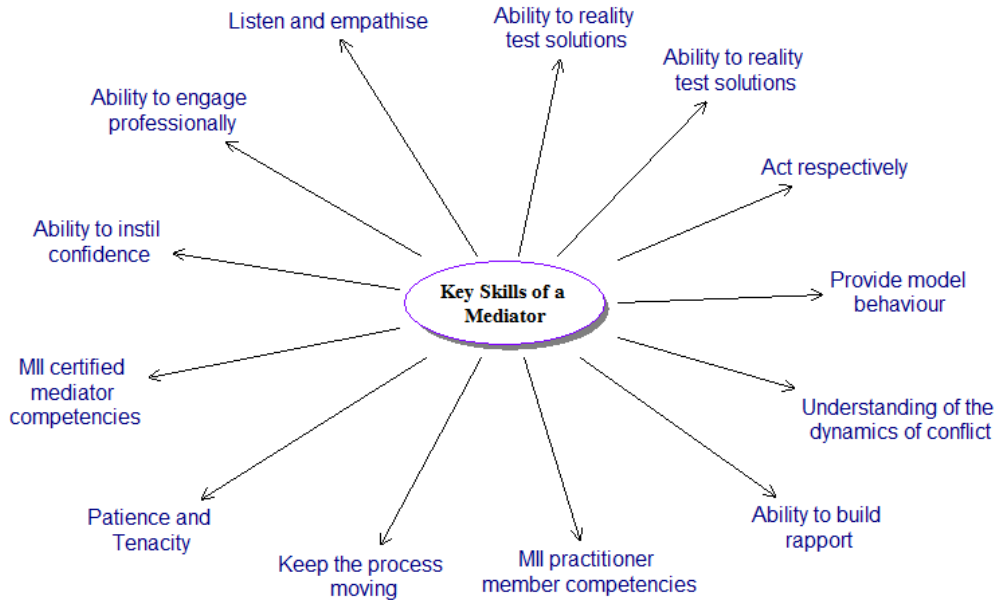
Figure 1. Mediator skills.

The results of which were imported into Banxia’s™ Decision Explorer™ mind mapping software, where it was analysed and manipulated accordingly. Each of the interviews were amalgamated and dissected, resulting in the documentation of the following findings.