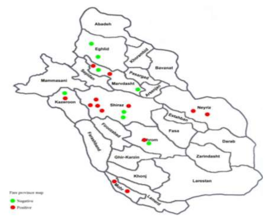
Figure 3. Map of Fars province showing the selected areas for sample collection. Dark circles show areas that the chickens had \log 2 HI antibody titer \geq 4 and light circles show areas that the chickens had \log 2 HI antibody titer \leq 4 .