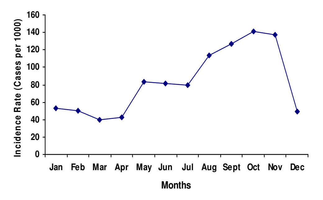
Figure 2. Monthly malaria incidence rate.