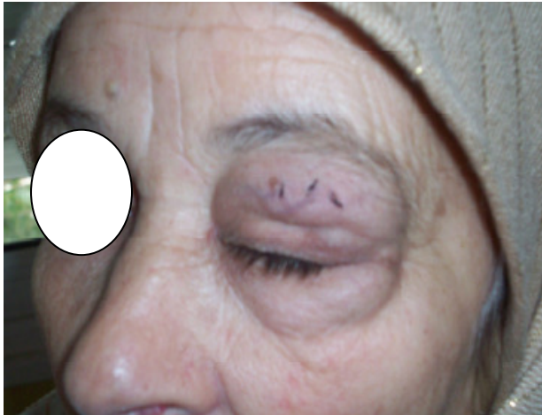
Figure 1. Left orbital mass.