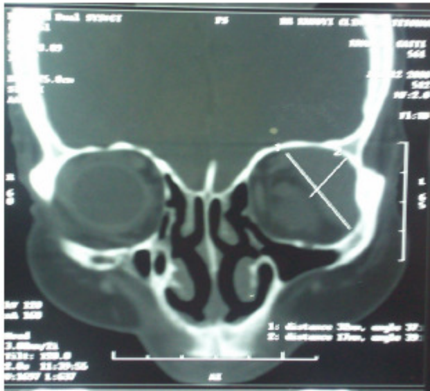
Figure 2. Orbital process with extension to the lacrimal glands and the upper eyelid.