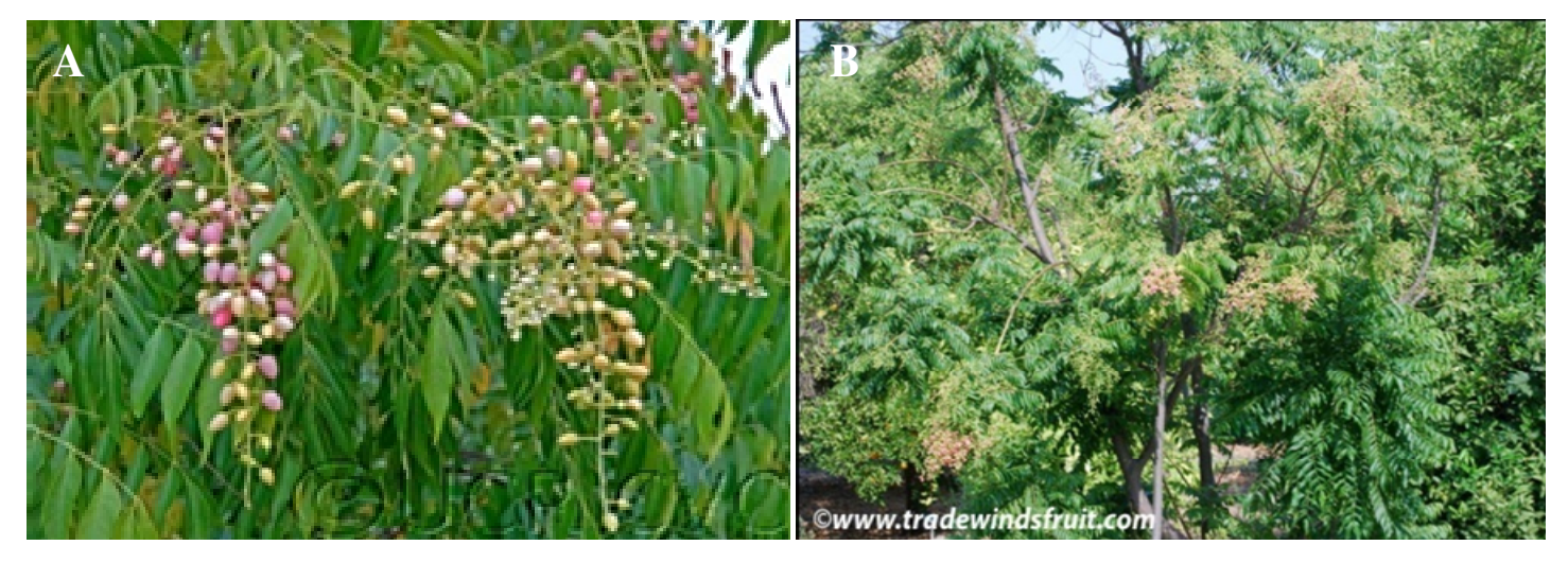
Figure 1. C. excavata (Burm. f, Rutaceae); (A) the fruits and leaves; (B) the appearance of overall tree.

elucidated using different spectroscopic methods. Details are given in Aoudou et al., (2010).