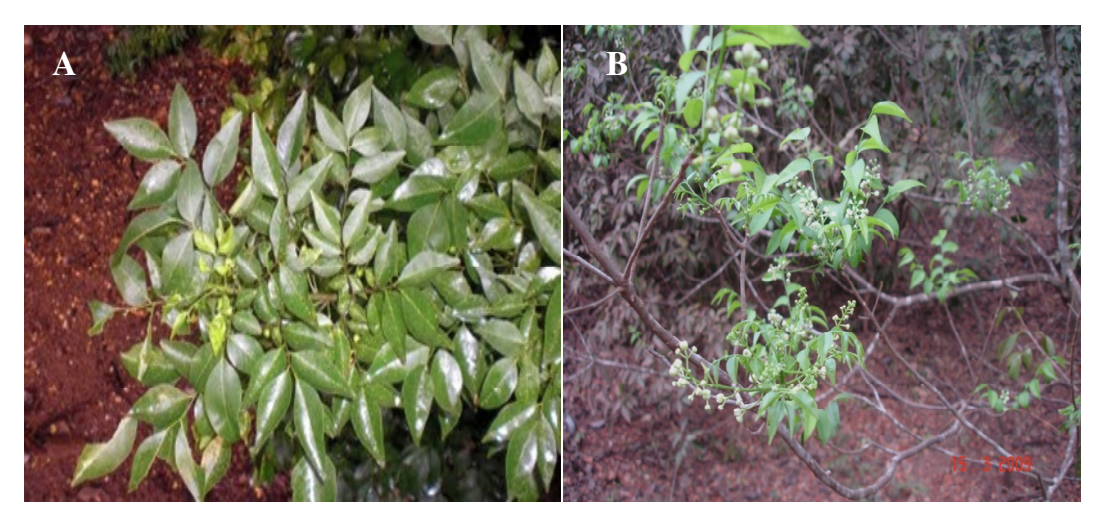
Figure 6. C. dentata (Willd.) M. Roem. (A) the leaves of the plant; (b) the appearance of the overall plant.

tree plant, belonging to the family of Rutaceae and found in India, Sri Lanka and China. It is a small tree; 2 to 6 m high with a delicious fruit not uncommon on the Anamallays up to 3,000 feet both in the moist woods and in the drier forests, it flowers in April and the fruit begins to ripen at the end of June. The tree is well known to the hill tribes and called 'Mor Koorangee.' it has leaves that are more membranaceous, highly odoriferous, more prominently dotted, and very erose toward the apex (Diep et al., 2009).