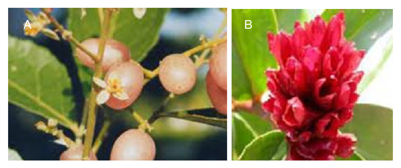
Figure 4. C. harmandiata (Pierre) Guill.; (A) the fruit of the plant (B) the flowers and leaves.

many health benefits. The activity-guided separation of an ethyl acetate-solvent fraction on a polyamide column followed by silica gel column and high performance liquid chromatography (HPLC) preparation afforded a pure coumarin, which was identified to be 8-hydroxypsoralen (Prasad et al., 2009). Also two new coumarins, namely Clausenalansimin A and B, together with seven known coumarins were isolated from twigs of C. lansium (Maneerat et al., 2010). Four furanocoumarins were isolated from the stems of C. lansium Skeels (Wu et al., 1999).