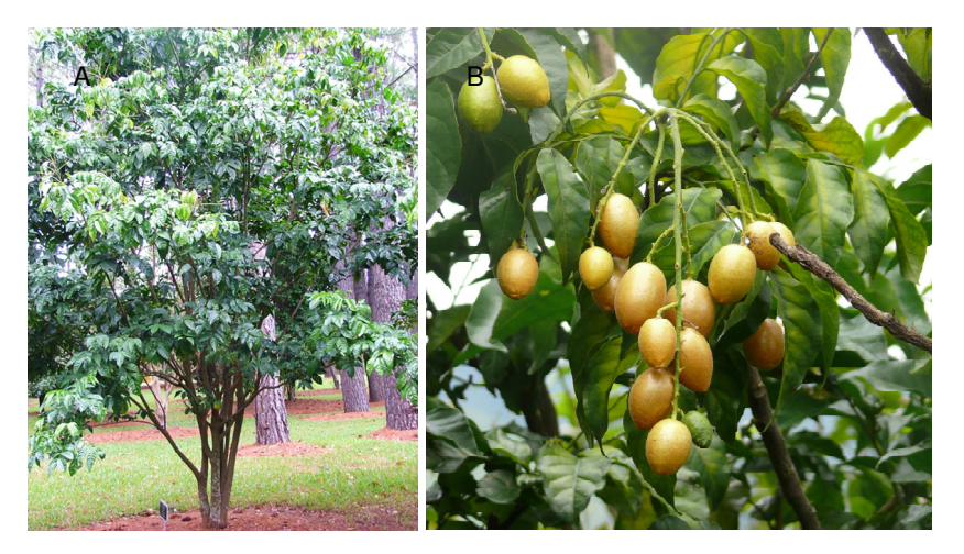
Figure 3. C. lansium (Lour.) Skeels; (A) the appearance of the overall plant; (B) the leaves and fruits.

isolation of 21 coumarins from the leaves, stem-bark and roots of this plant and their biogenesis is also discussed.