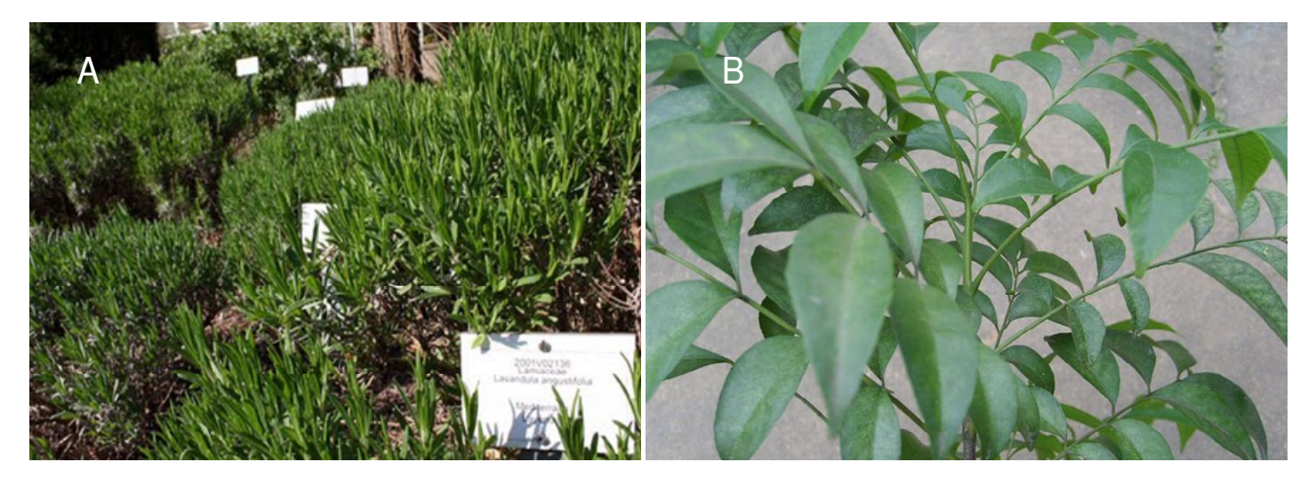
Figure 5. C. anisum -olens (Bl.) Merr.; (a) the overall plant; (b) the leaves of the plant.