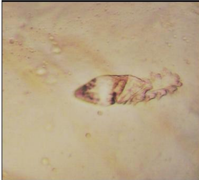
Figure 1. Adult Demodex spp. 100X.