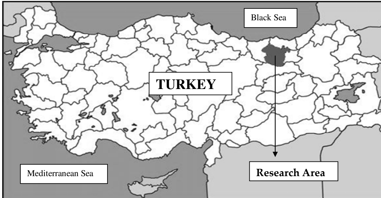
Figure 1. Location of the research area.

cultivators in the area and society as a whole (Jayasuriya, 2003).