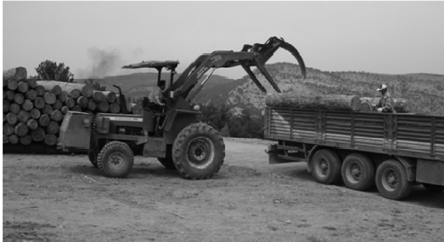
Figure 1. Loading equipment-mounted, open tractor.