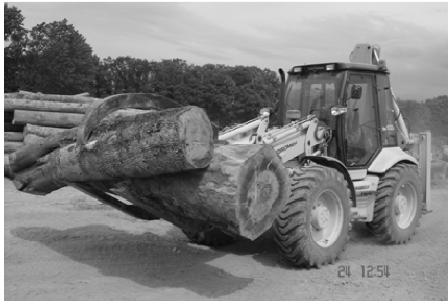
Figure 2. Loading machine with original-cab.

information related to the noise that the operator of a 2007 model Massey Ferguson-brand tractor was exposed to during 11 min work is presented in Table 2.