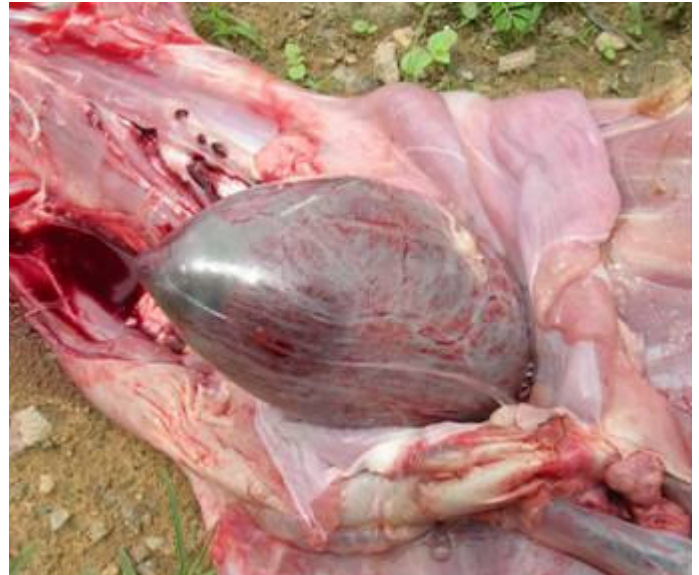
Figure 3. Distended urinary bladder filled with urine.