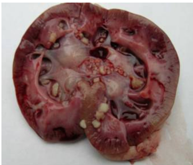
Figure 2. Amorphous granular crystalline, irregular calculi of varying size in kidney.