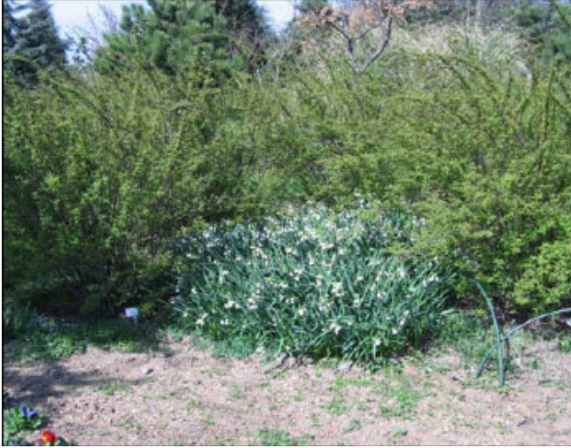
Figure 3. Use of Leucojum aestivum L. with bushes (Nezahat Göküyğit Botanical Garden/Istanbul).

its leaves that have visible white tracheas as well as spica shaped fruits that follow the flower structures in the form of white paper, it is also able to provide a contrast in autumn with its fruits, which have an flame red color as well as a shape of spica (Leholm, 1998; Anonymous, 2004; Cornwell, 2004; Anonymous, 2005).