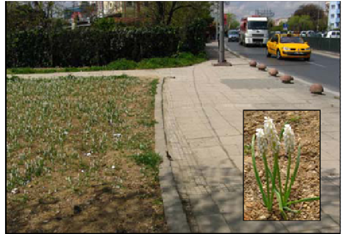
Figure 2. Use of Muscari in flowing masses on the sides of the road (Ataköy coast road/Istanbul).

Geophytes create a strong visual impact due to their use in drifts (flowing masses), groups and sets for design applications. Their use in drifts gives an appeal to the area. Small bulbous species such as Scilla , Crocus and