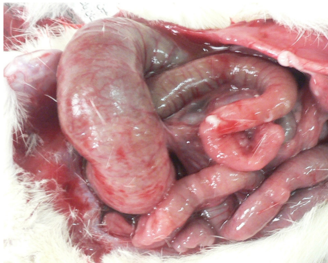
Figure 1. The viscera of dead rat after high-dose essential oil treatment period.

with horseradish peroxidase for another 1 h. Finally, membranes were washed 3 \times 10 min with 1 \times TBST solution, signals were detected using ECL and Lumi-Film Chemiluminescent Detection Film (Roche Applied Sciences, Germany). All stages of immunoblotting were done under constant shaking.