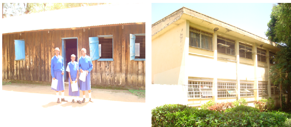
Figure 3. Art room with Rudimentary Facilities and a Physics Laboratory in a School in Nyanza Province.