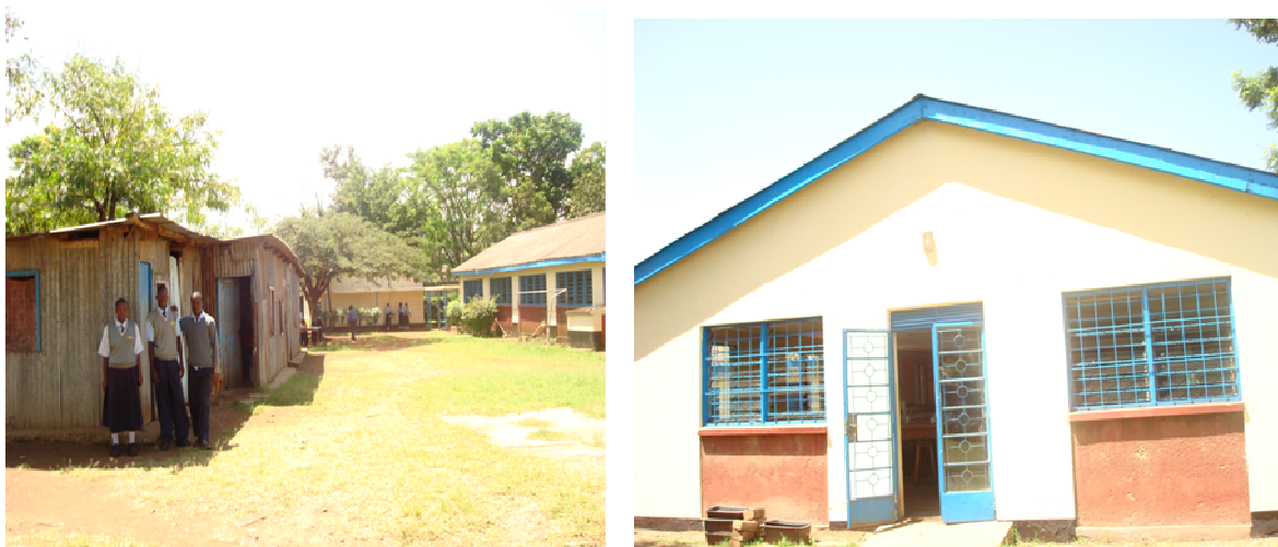
Figure 2. Art room with Rudimentary Facilities and a Chemistry Laboratory in a Secondary School in Nyanza Province.