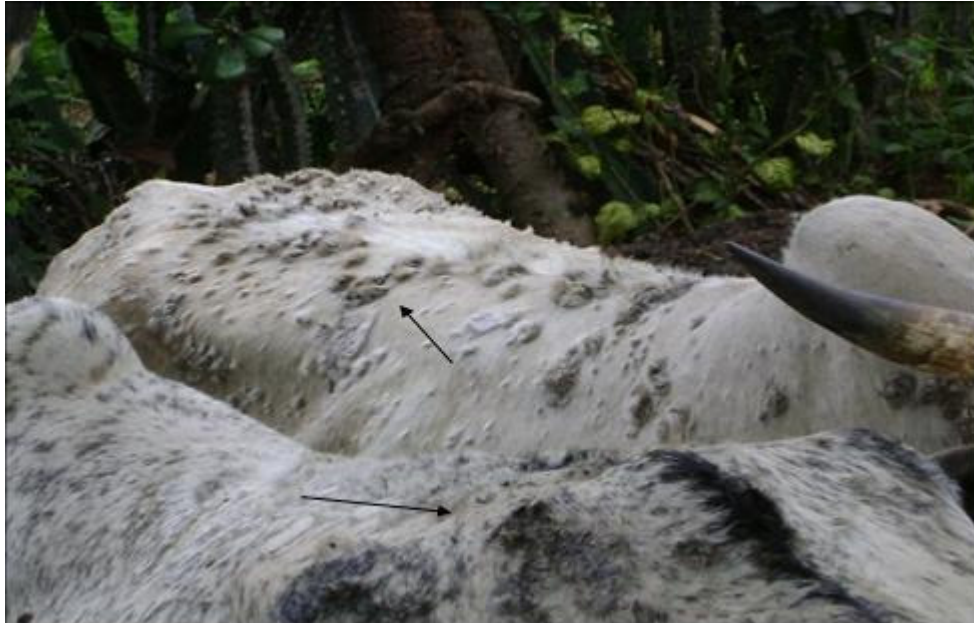
Figure 2. A group of cattle showing lesions of dermatophilosis (arrow).