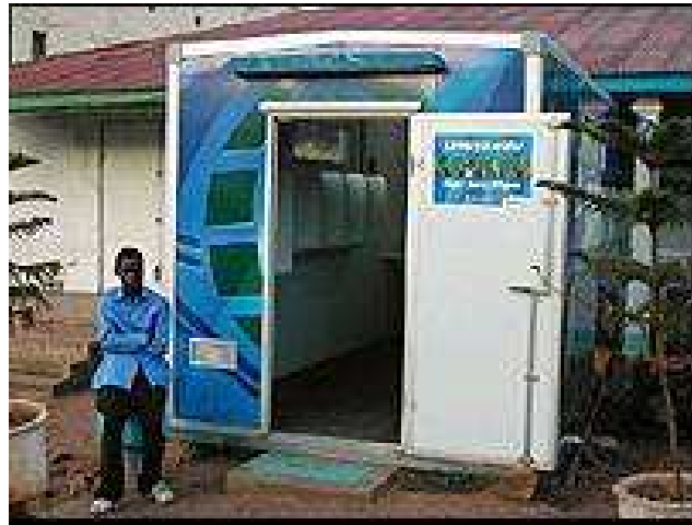
Figure 2. Simu Ya, Tanzania.