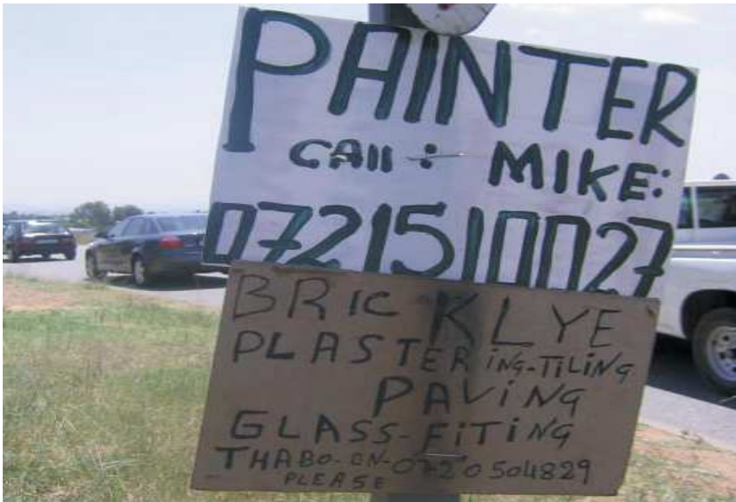
Figure 4. The Vodafone policy paper series • number 2 • March 2005 Africa: The impact of mobile phones.

phenomenon, especially in the context of their huge economic and social challenges. Morocco is a good example of the spread and impact of cell phones. In 1995, the Moroccan telecoms penetration rate was 4 fixed-lines per 100 people and zero mobile phones per 100 people. Only eight years later, mobile penetration alone in Morocco was 24 per 100 people, while fixed-line penetration stayed essentially the same.