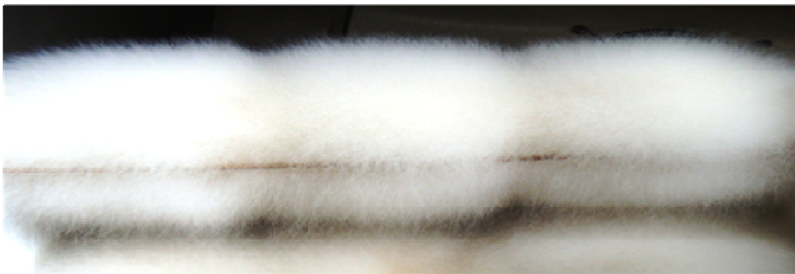
Figure 1. Growth of Mucor sp. in the surface of mao-tofu fermented for 4 days.