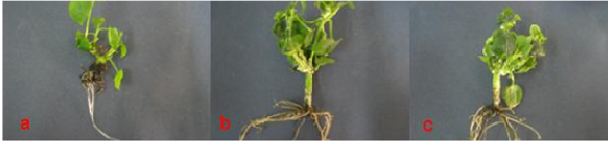
Figure 4. Multiple shoots induction and root formation in three cultivars. a) Sahel genotype, b) Siokra genotype, and c) Hybrid genotype.