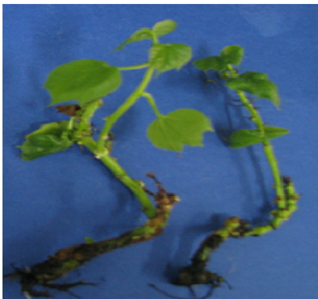
Figure 3. Effect of zeatin in multiple shoot formation.

Siokra genotype showed relatively more survival rate compared to the other two cultivars studied (Figure 5).