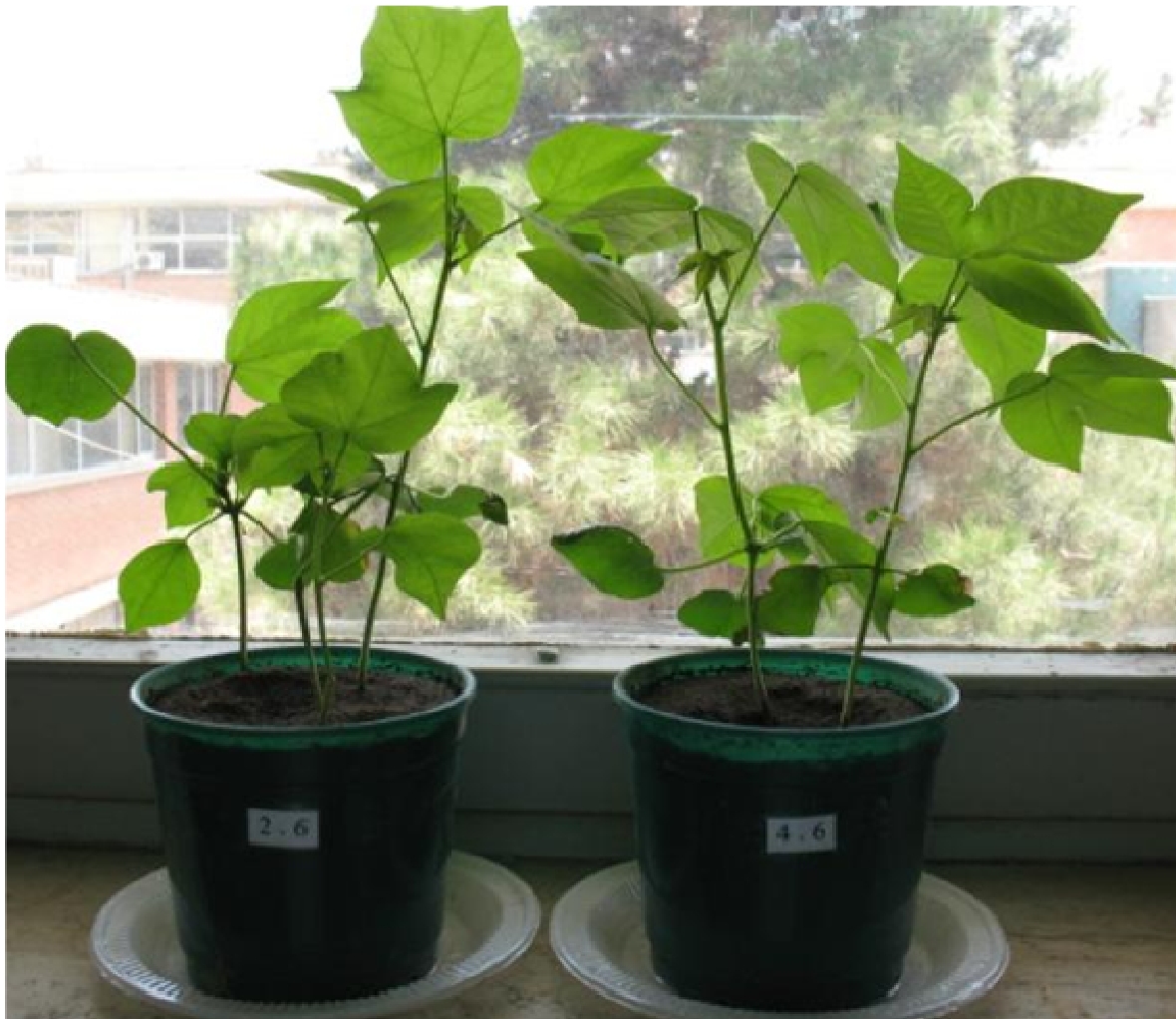
Figure 5. Regenerated plants transferred to soil.

Similarity significant difference in stem length was observed in third, sixth and seventh sub-cultures compared to fourth subculture plants (Table 1).