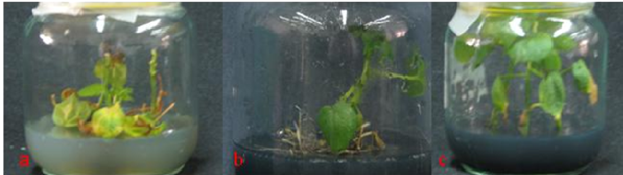
Figure 2. Comparison of three media in multiple shoot formation. a) MS1, b) MS3, and c) MS2.