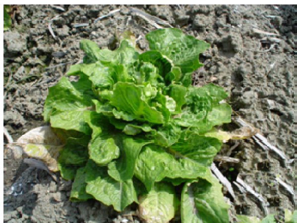
Figure 6. Symptoms of leaf deformation induced by Tobacco streak virus isolated from lettuce in Iran on Lactuca sativa .

Lactuca sativa 10-15 days after inoculation developed leaf distortion and mosaic (Figure 6; Table 1).