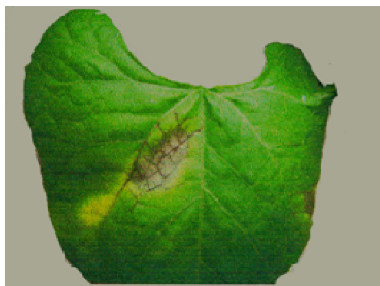
Figure 3. Symptoms necrotic local lesions of Tobacco streak virus isolated from lettuce in Iran on Phaseolus vulgaris cv. Red Kidney.