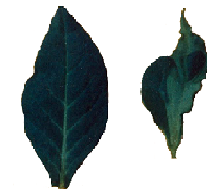
Figure 5. Systemic leaf distortion and vein necrosis symptoms induced by Tobacco streak virus isolated from lettuce in Iran on Nicotiana clevelandii .