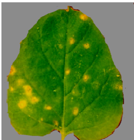
Figure 4. Necrotic and chlorotic local lesions symptoms of Tobacco streak virus isolated from lettuce in Iran on Nicotiana tabacum cv samsun.