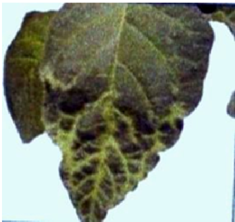
Figure 2. Systemic symptoms of Tobacco streak virus isolated from lettuce in Iran on Datura stramonium .